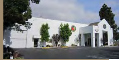
GARDEN GROVE, CA