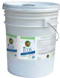
ECOS® Free and Clear 5 Gallon pail