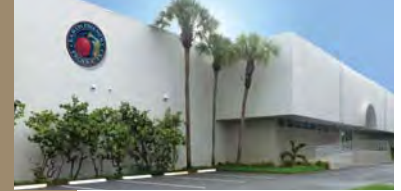
OPA LOCKA, FL