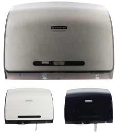
Mod* Coreless JRT Jr. Dispensers