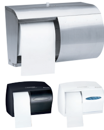
Coreless Double Roll Dispensers