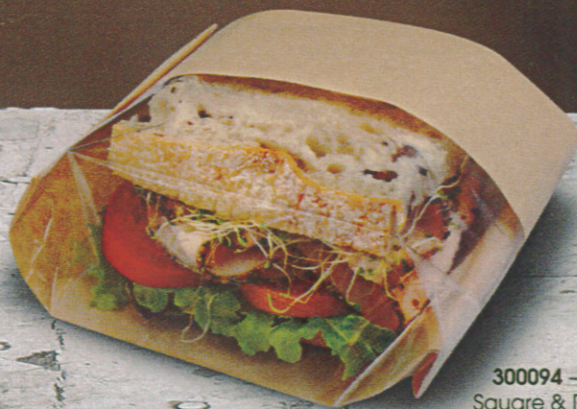
300094 - Versatile Bag for Square & Round Sandwiches