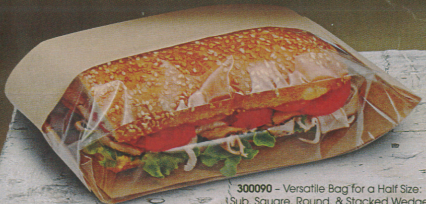
300090 - Versatile Bag for a Half Size: Sub, Square, Round, & Stacked Wedge

Our innovative DubView® design accommodates a wide variety of deli sandwiches