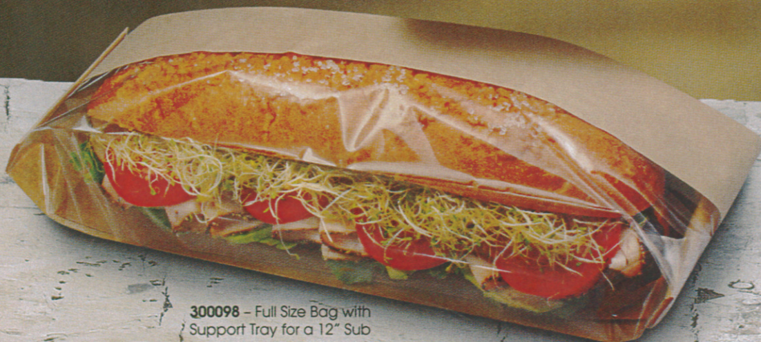
300098 - Full Size Bag with Support Tray for a 12" Sub